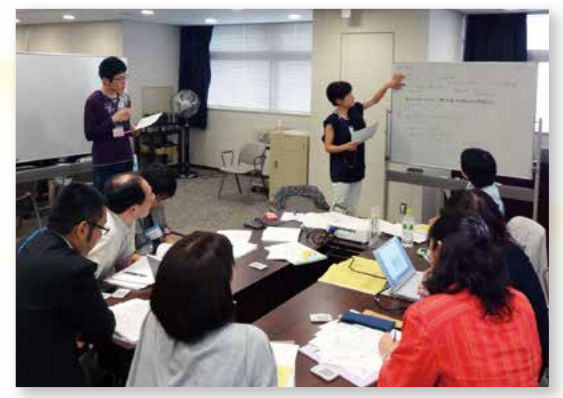
Workshop sessions for sports pharmacists