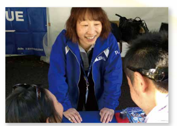
Outreach activities to disseminate information to athletes and the public