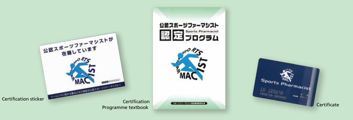
Sports Pharmacist Materials